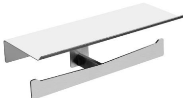
AI2004C Bright finish