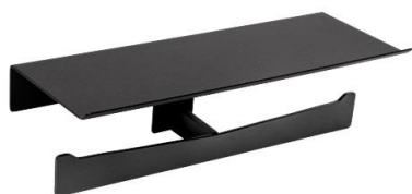
AI2004B Black finish