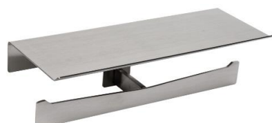
AI2004CS Satin finish